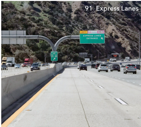
91 Express Lanes