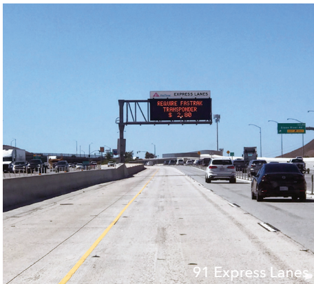
91 Express Lanes