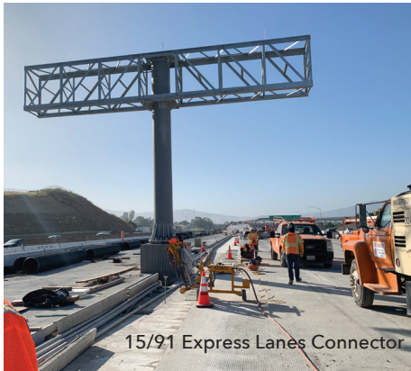
15/91 Express Lanes Connector