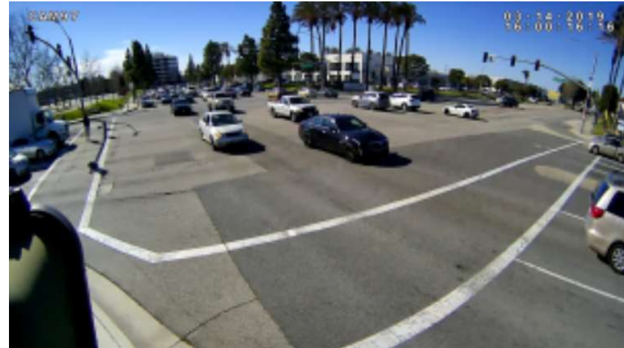
Example of count camera, Counts Unlimited