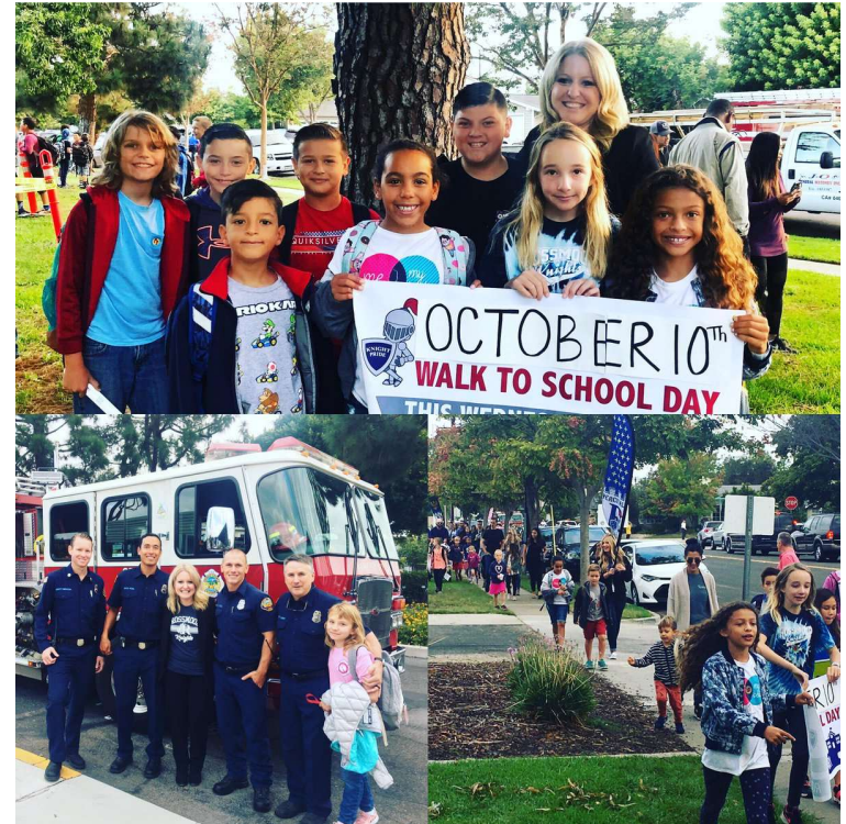
Walk to School Day, Rossmoor Elementary