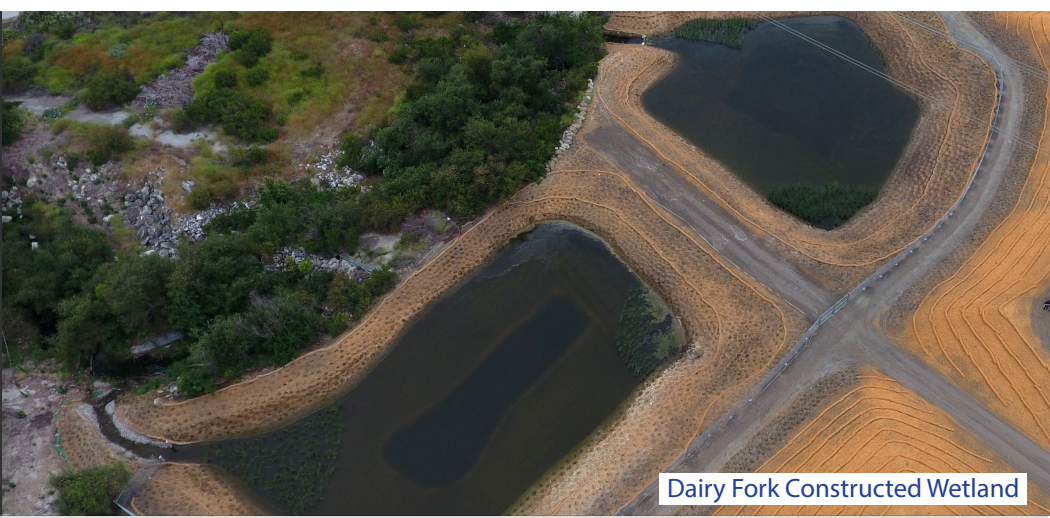
Dairy Fork Constructed Wetland