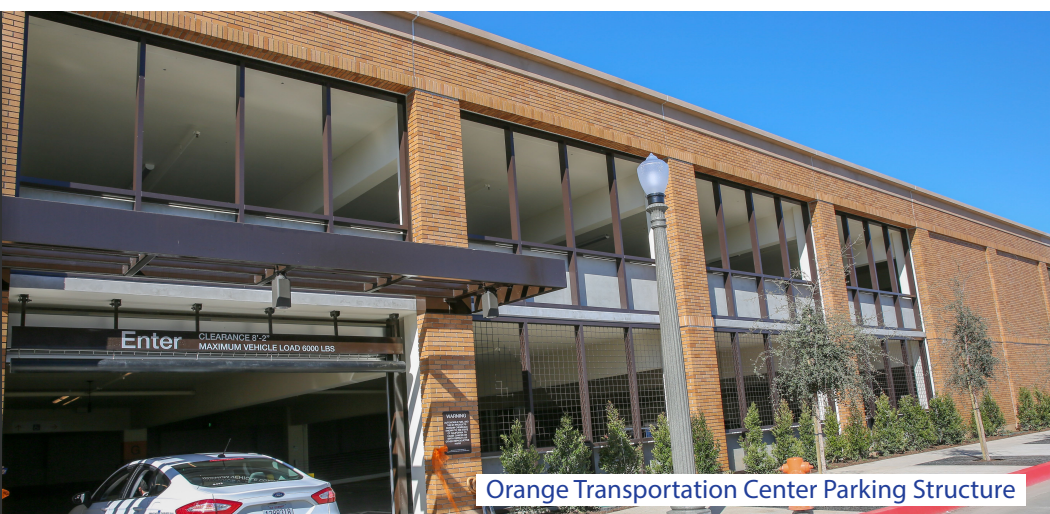
Orange Transportation Center Parking Structure