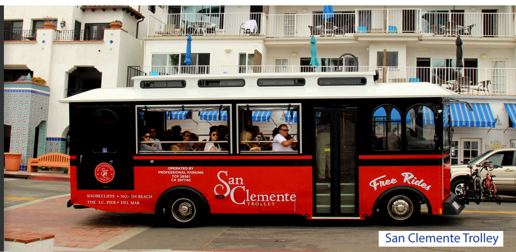
San Clemente Trolley