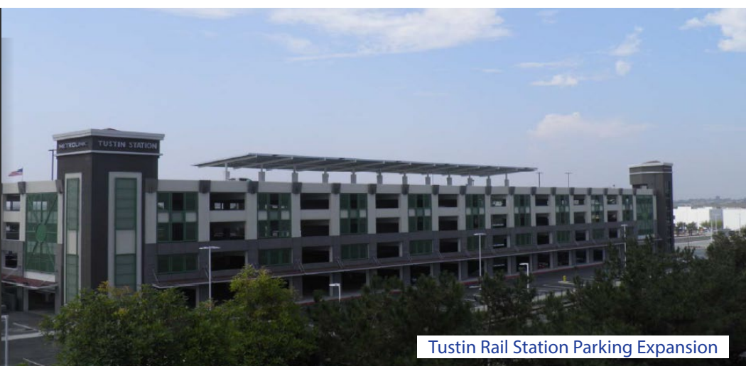
Tustin Rail Station Parking Expansion