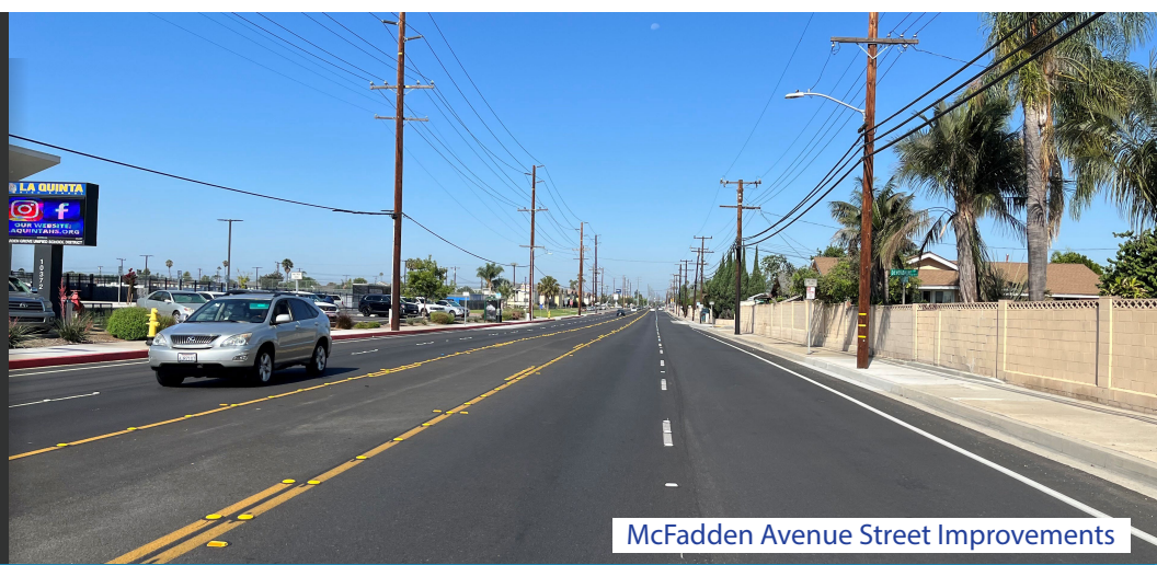
McFadden Avenue Street Improvements